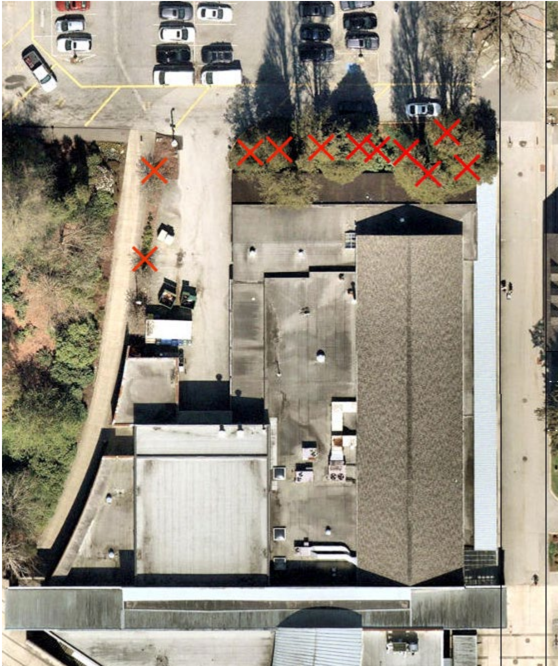
Figure 2 – Impacted Trees for Removal (11)