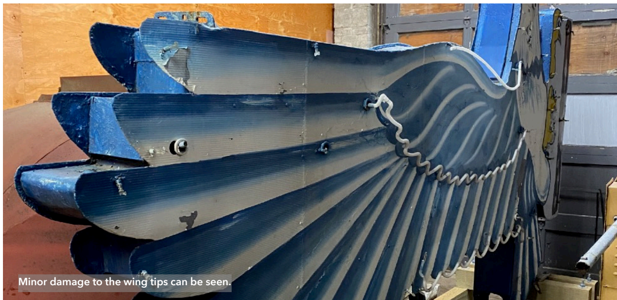
Minor damage to the wing tips can be seen.