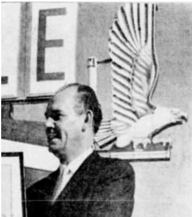
One of the earliest images of the Burnaby Eagle from the Vancouver Province in 1966 showing the body of the bird in white and still perched on the Richfield base.