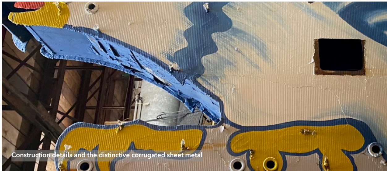
Construction details and the distinctive corrugated sheet metal