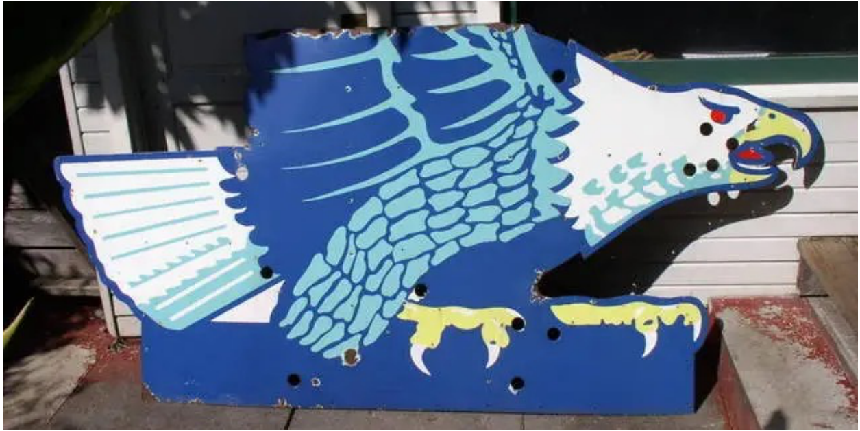
An example of a porcelain enamel sign showing the flatness and lack of detail of the design versus the hand painted version.