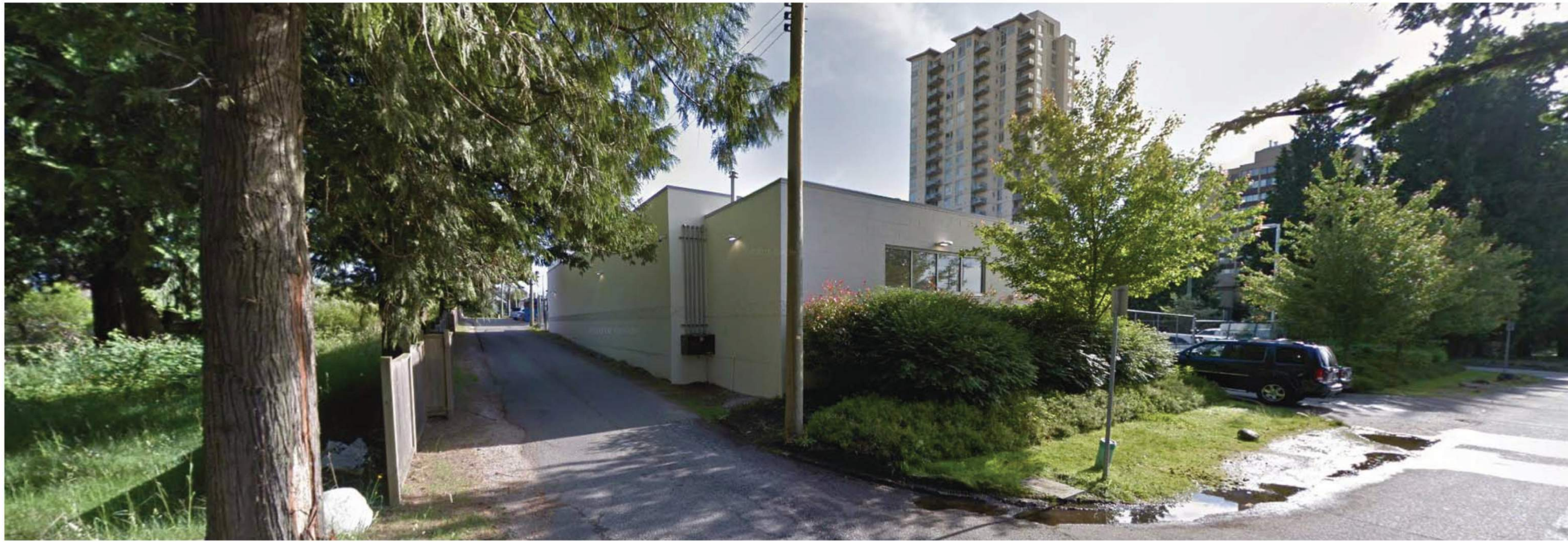
2.SOUTHWEST- BERESFORD STREET