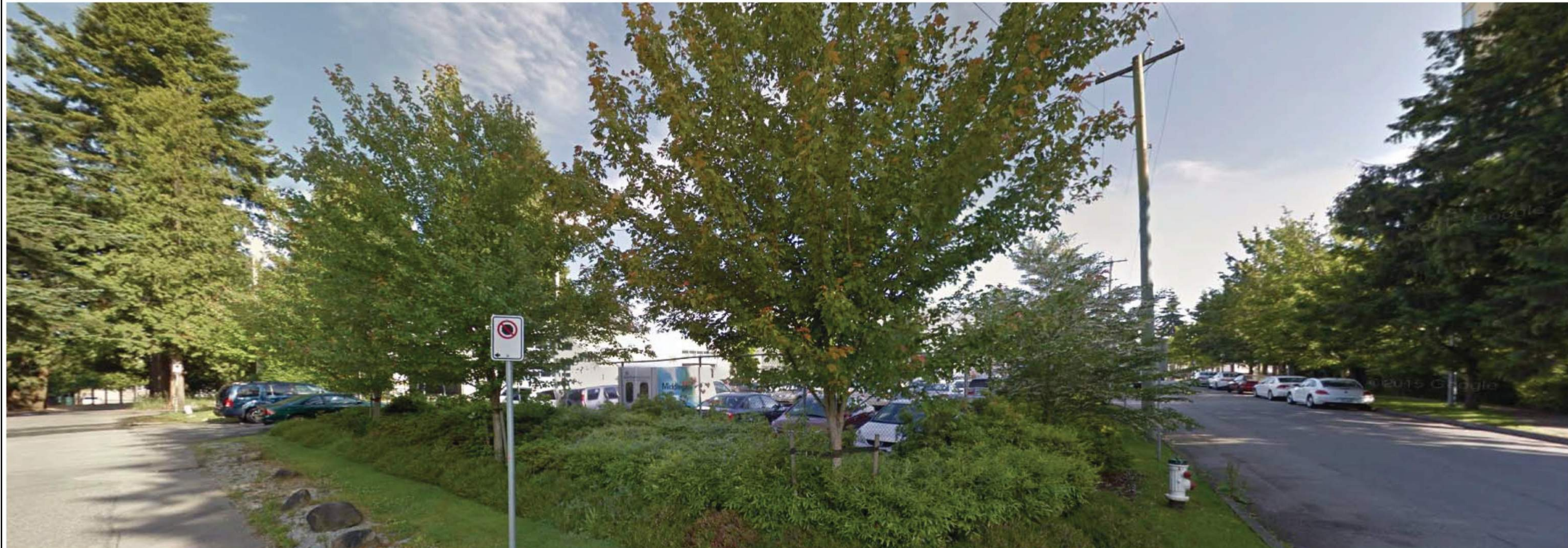
3. SOUTHEAST - BERESFORD STREET