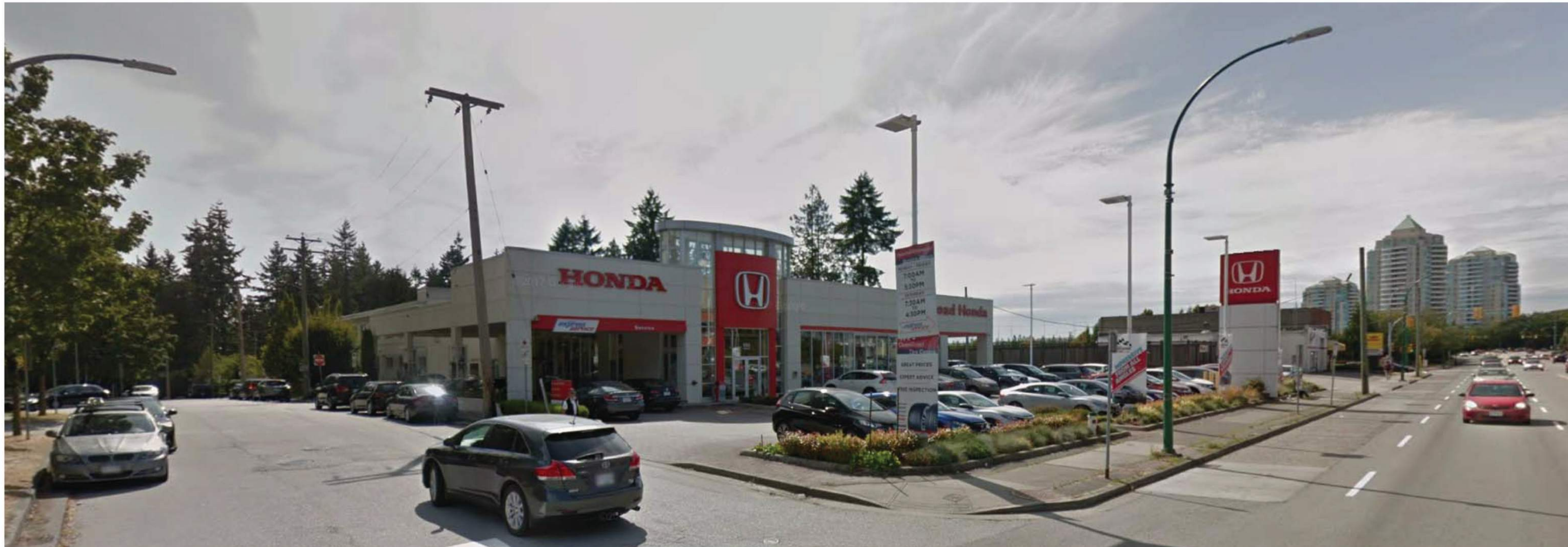
4.NORTHEAST- KINGSWAY& GREENFORD AVENUE