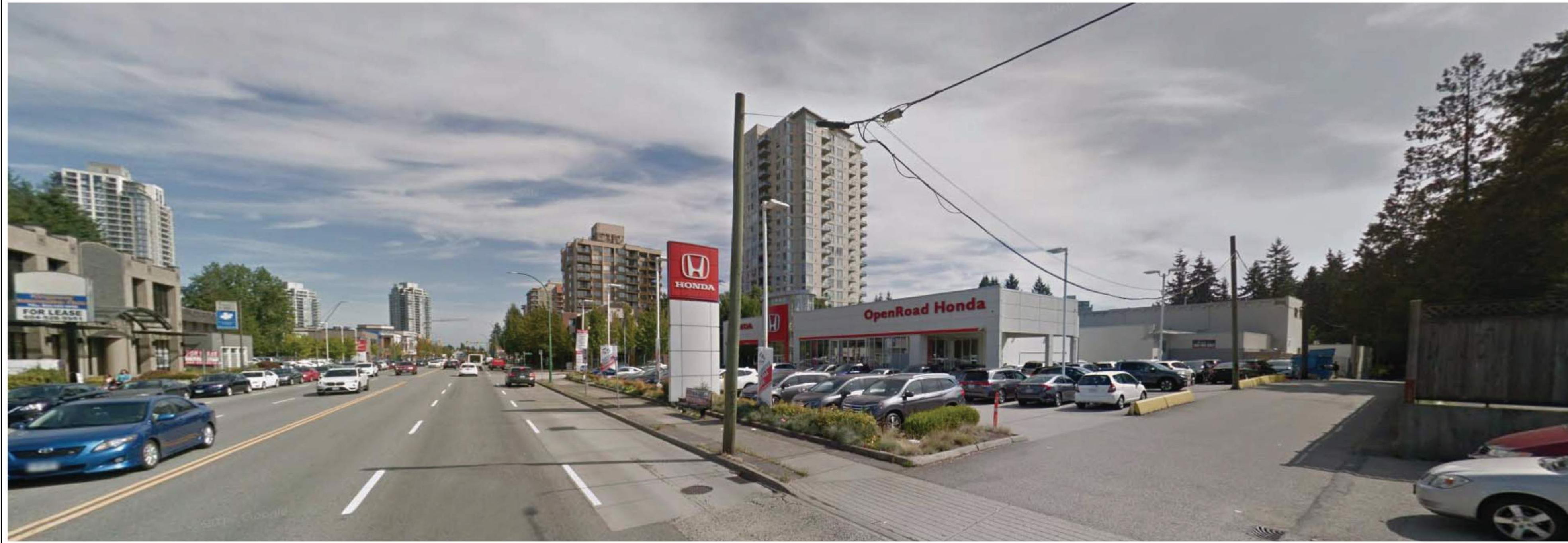
1. NORTHWEST - KINGSWAY