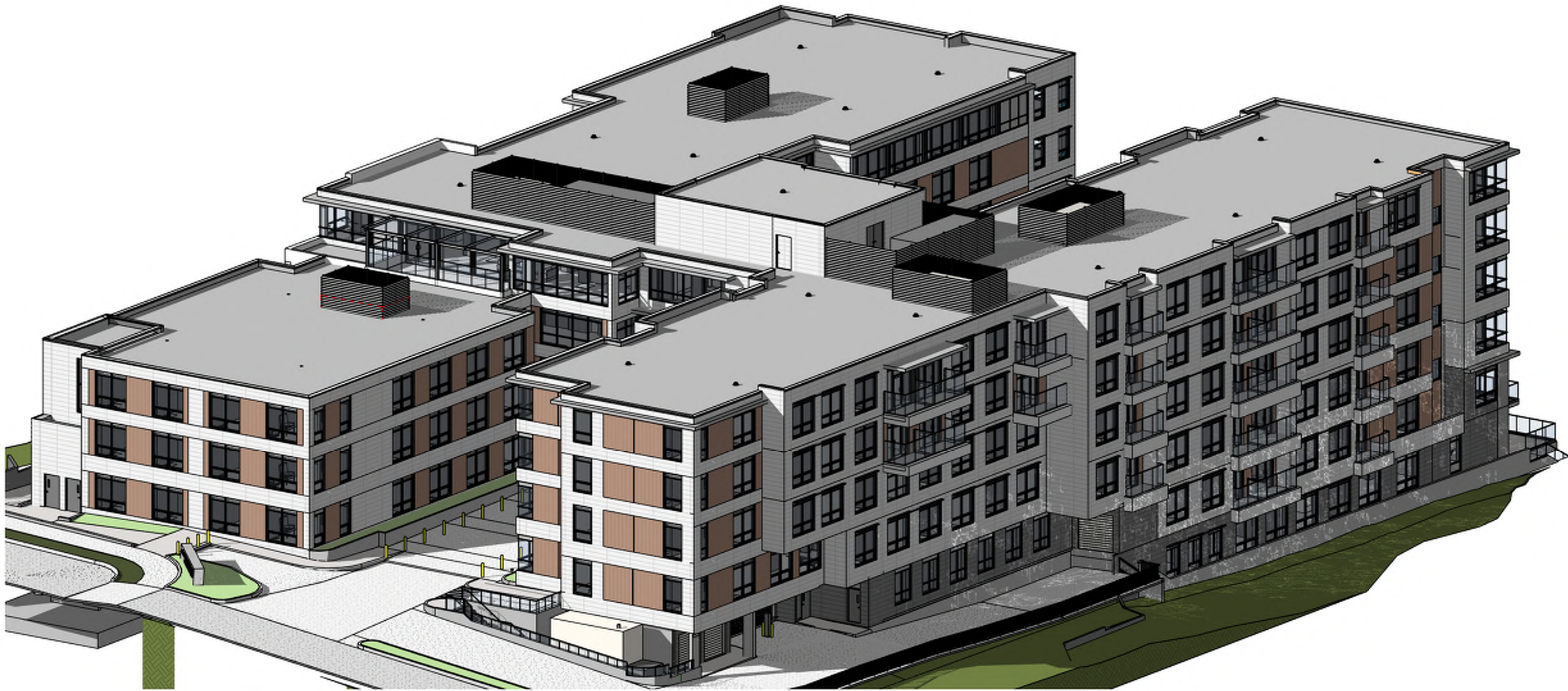
1 VIEW FROM CORNER SOUTH EAST Scale: