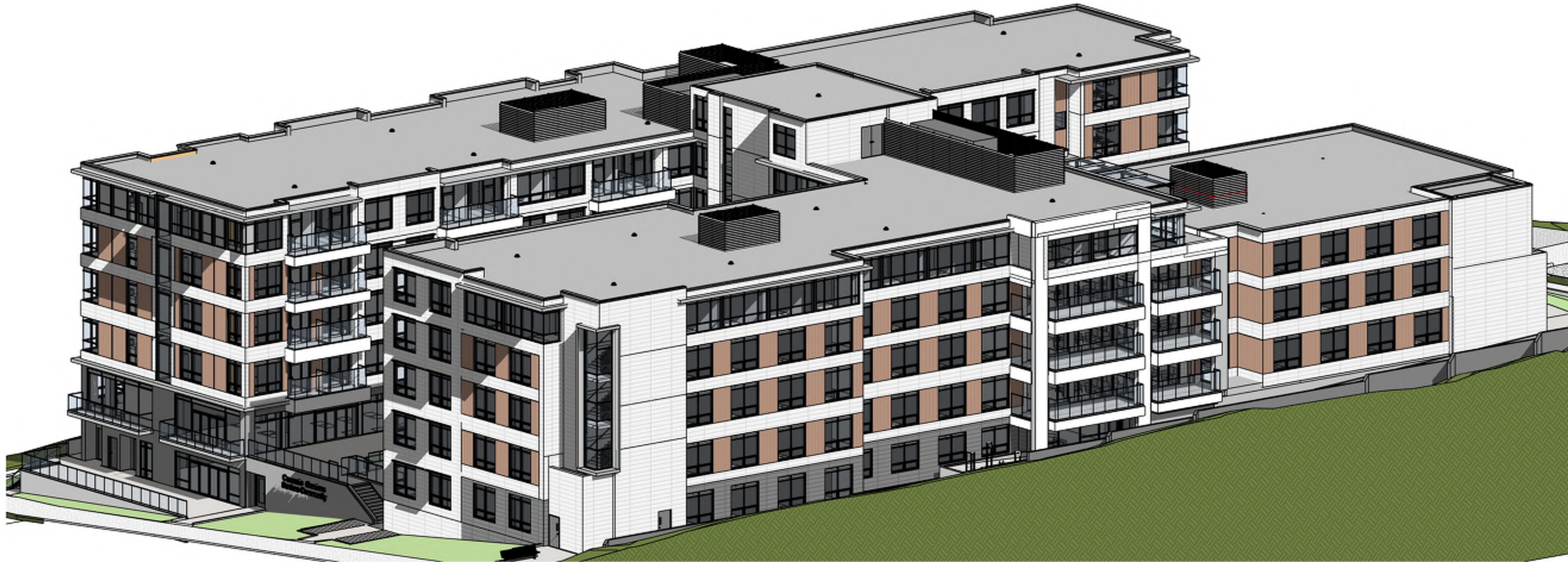
2 VIEW FROM CORNER NORTH WEST Scale:

CLIENT Jubilee Multi-Generational Housing Society