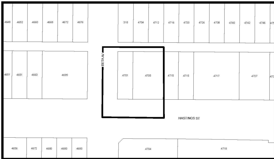
THE AREA(S) SHOWN ABOVE OUTLINED IN BLACK (——) IS (ARE) REZONED

LEGAL: Lot 36 Block 6 District Lot 122 Group 1 New Westminster District Plan 1308; and, Lot 75 District Lot 122 Group 1 New Westminster District Plan 54739