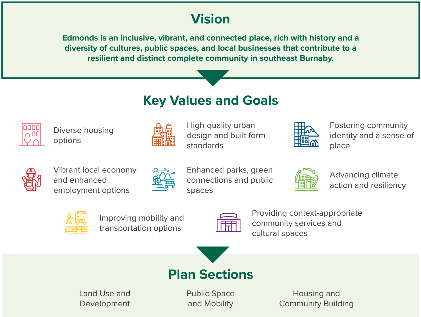
Figure 2. Vision, Key Values and Goals for the Edmonds Plan

The vision statement for the Edmonds Plan establishes broad-level aspirations for the community’s future and is further supplemented by a list of key values and goals that guide the community plan in achieving its vision. Together, the vision, key values and goals are reflected in the rest of the Edmonds Plan within various policy directions that will shape future land use and development, public space and mobility, and housing and community building in Edmonds.