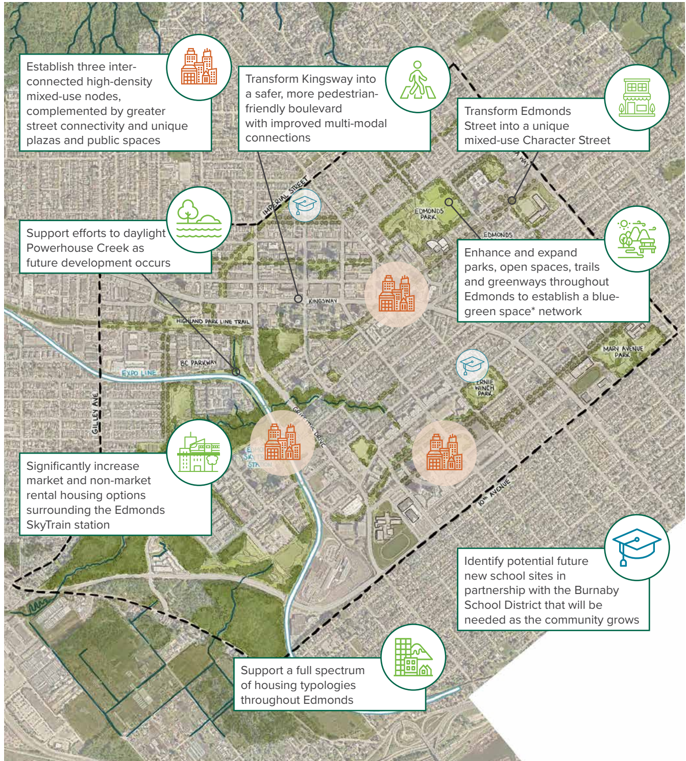
Figure 1. Big Moves and Opportunities for the Edmonds Plan

Figure 1 below outlines some of the big moves and opportunities envisioned for Edmonds, looking into the long-term future.