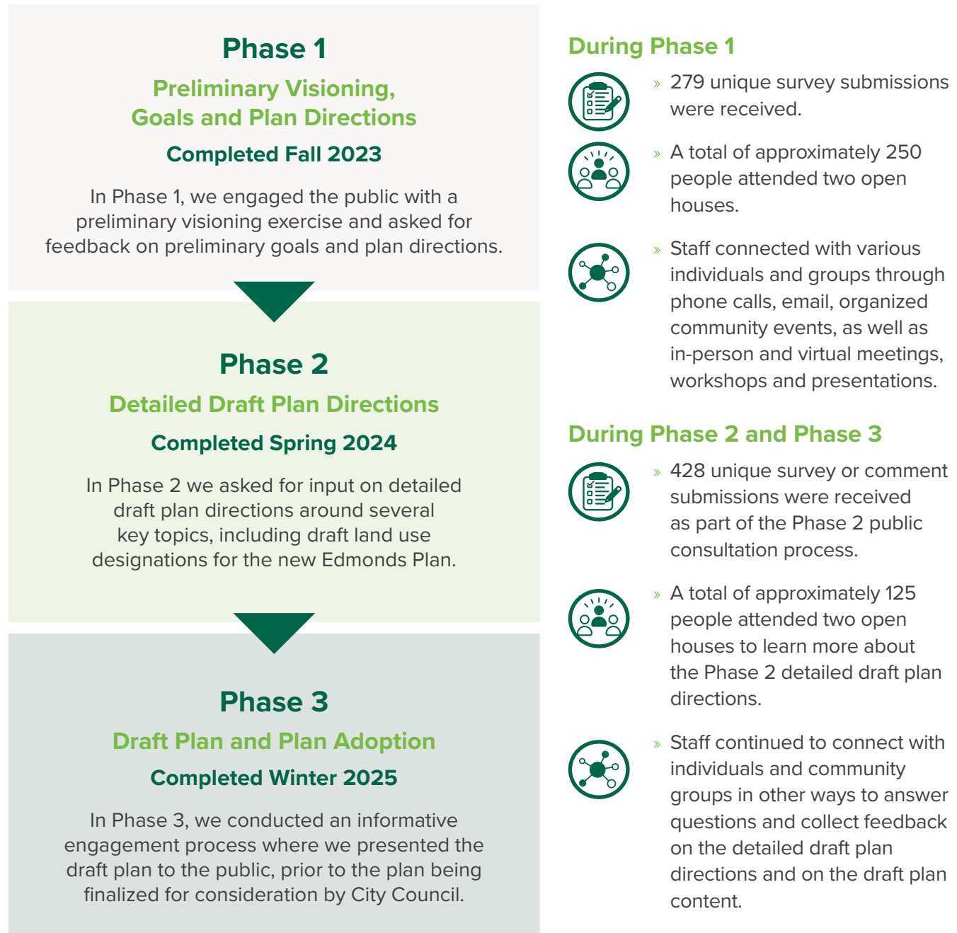
Figure 3. The Community Planning Process

The Edmonds Plan was developed through a multi-phased process involving several rounds of extensive public consultation and engagement with host Nations as well as area residents, various community groups, partners and organizations and other members of the public. Key highlights and milestones for each of the public consultation phases are outlined below.