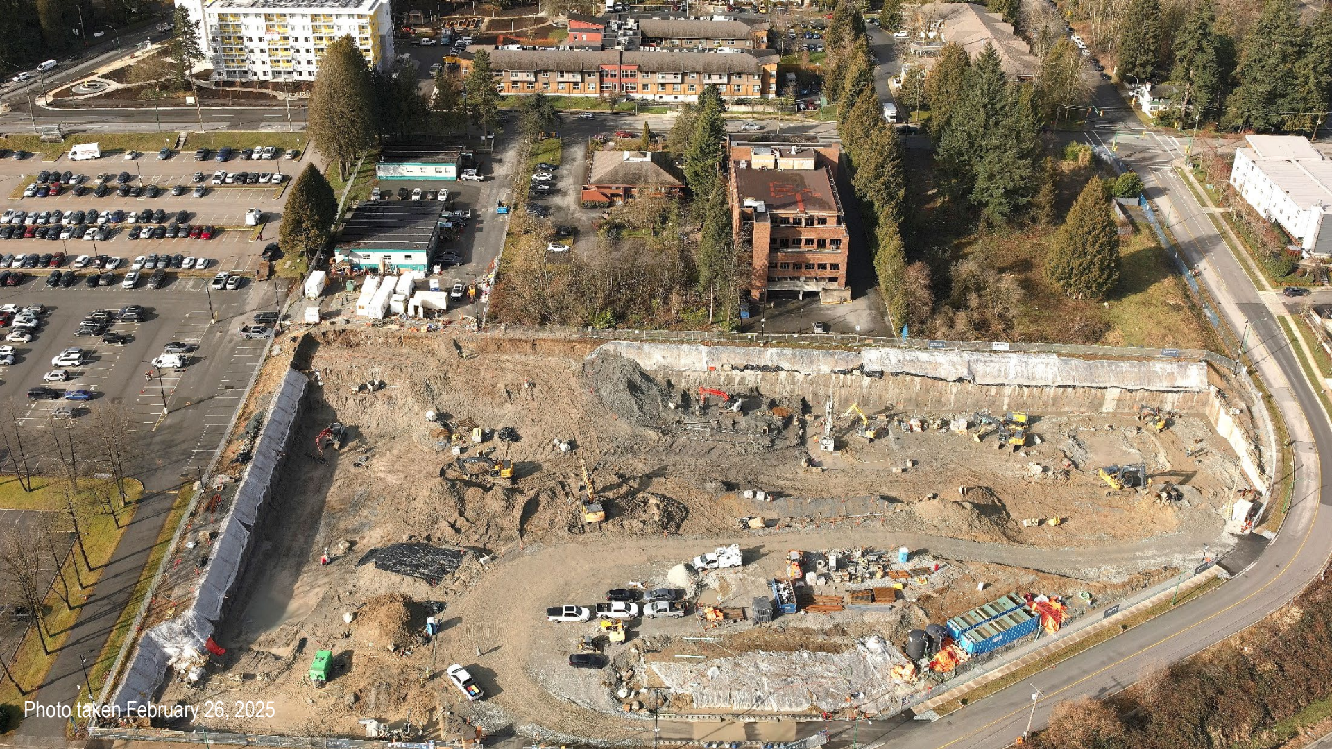
Photo taken February 26, 2025