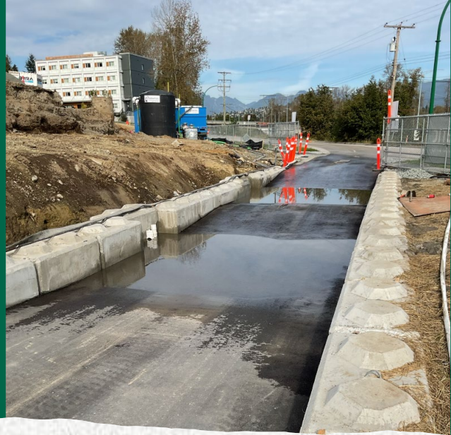
Truck Wheel Wash