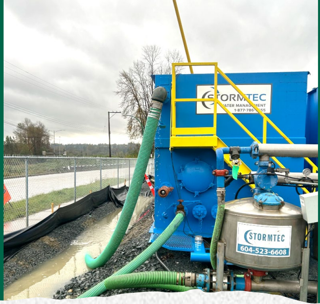
Sediment Erosion Control System with Real-Time Water Flow Monitoring