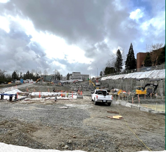
Site Excavation Activities February 2025