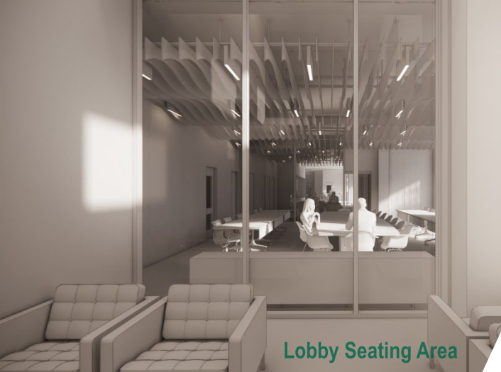
Lobby Seating Area