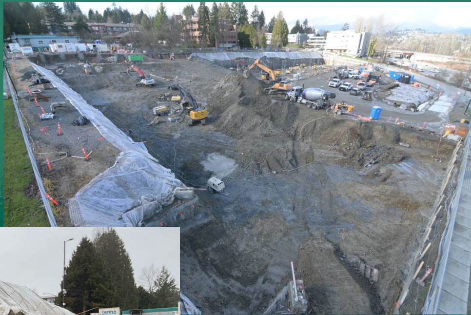
Excavation of Underground Parkade