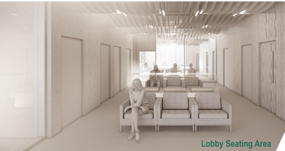
Lobby Seating Area