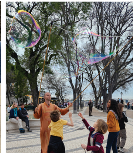
Precedents of temporary initiatives