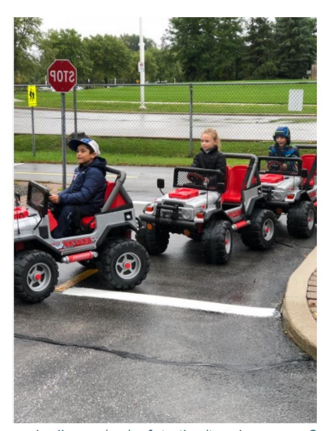
https://www.peelpolice.ca/en/safety-tips/teachers.aspx? mid =2202