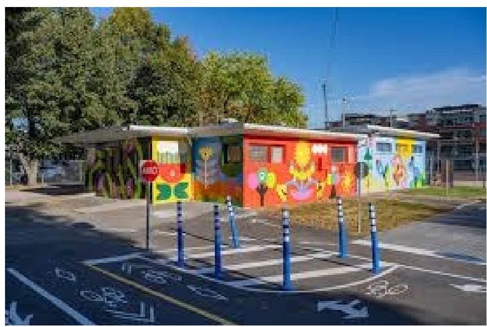
\underline{\text{https://csslaval.gouv.qc.ca/parc-bon-pasteur-nouvelle-destination-pour-}} \\ \underline{\text{lapprentissage-du-velo/}}