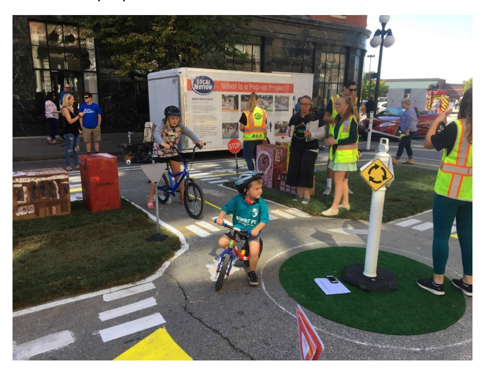
Pop Up Traffic Garden Rutland, Vermont, USA

\frac{https://www.wcax.com/content/news/Downtown-Rutland-becomes-giant-playground--561006121.html}{}