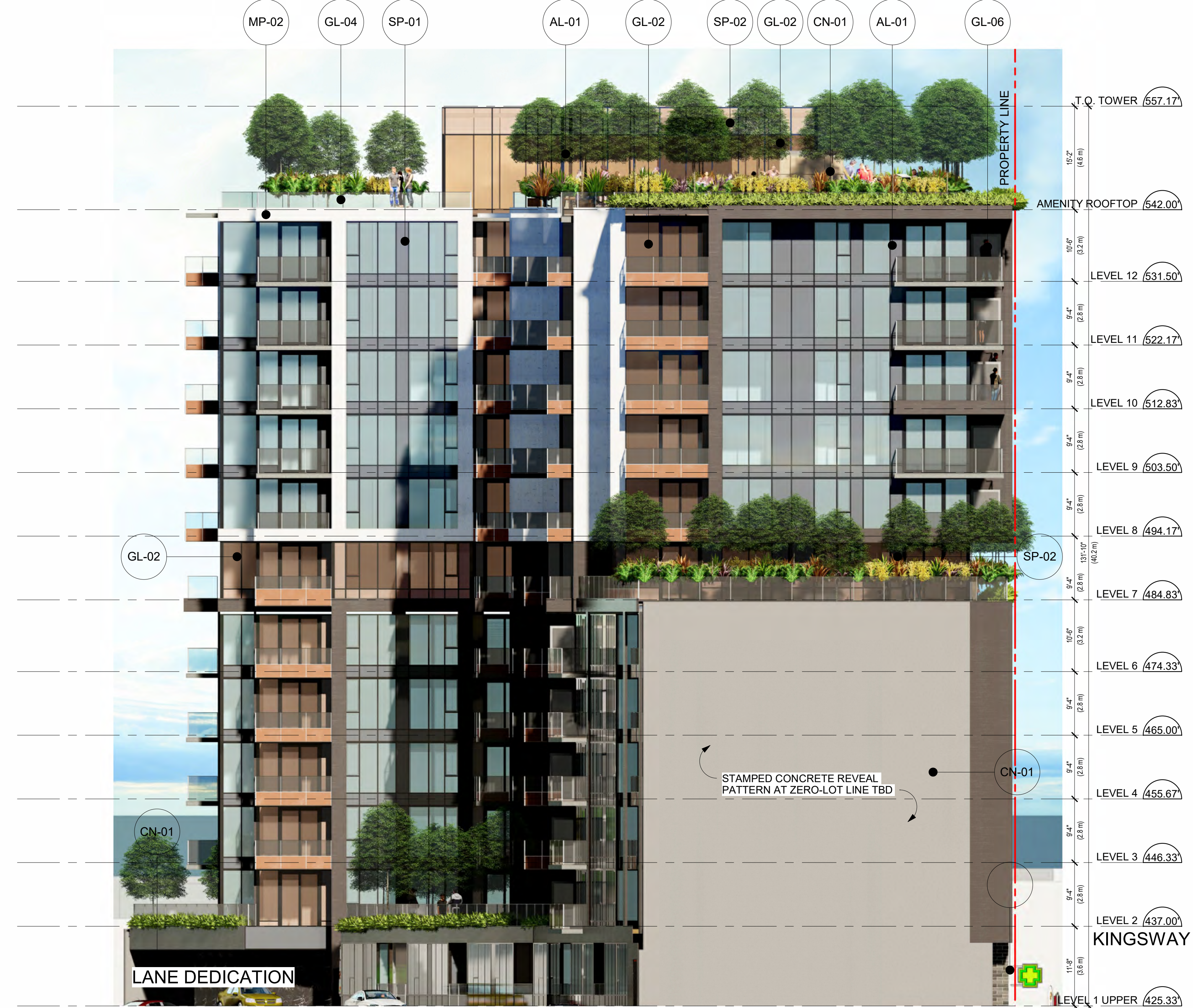
2 WEST ELEVATION 1" = 10'-0"