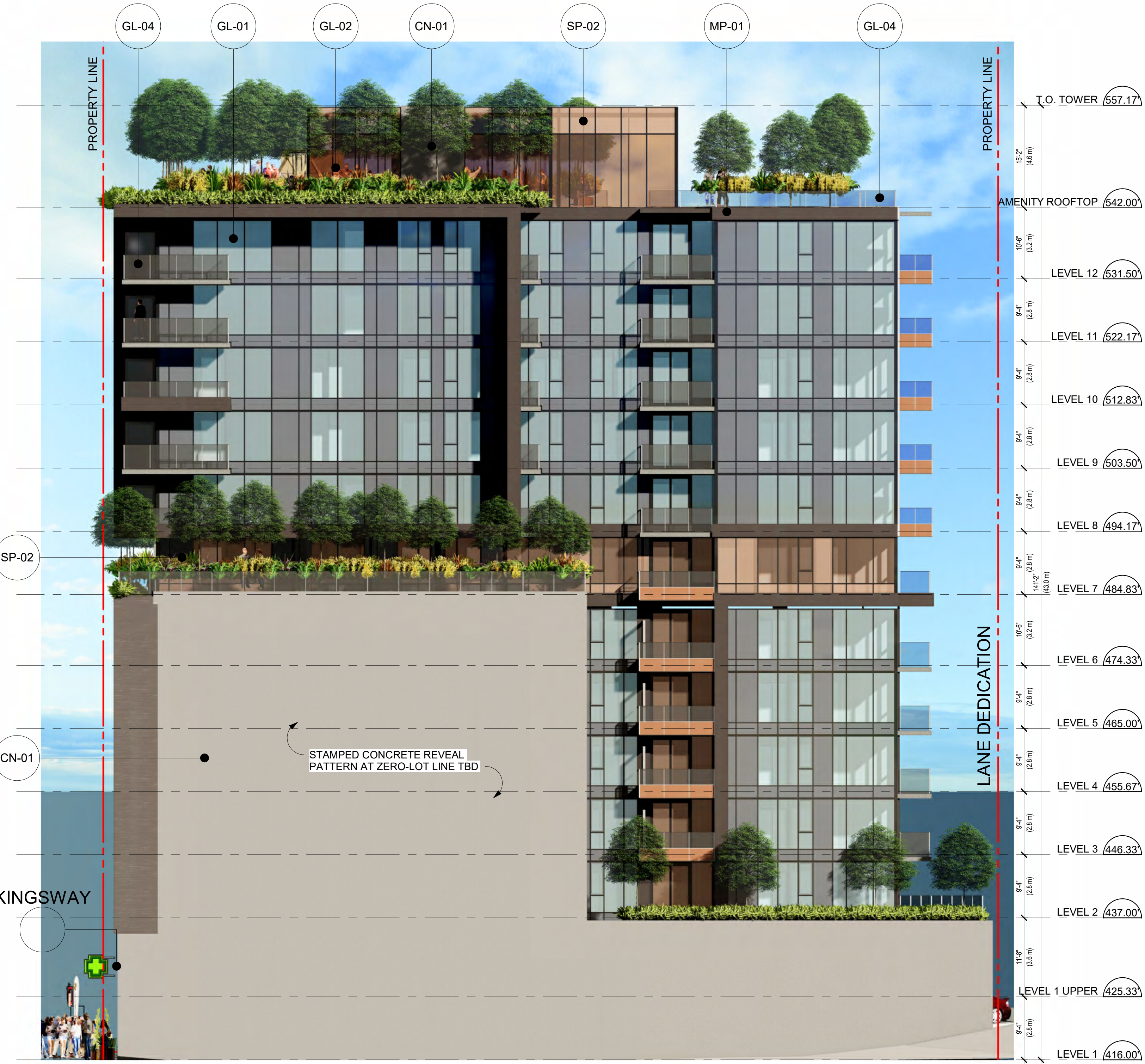
1 EAST ELEVATION 1" = 10'-0"